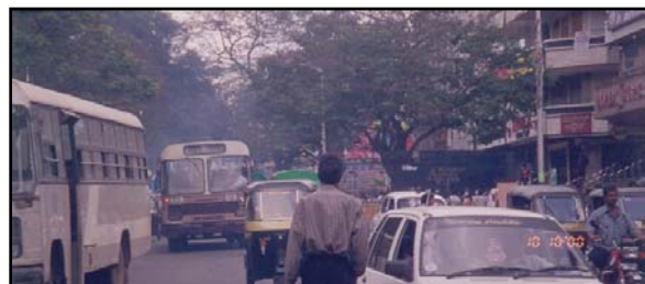
Pollution and congestion from transport in Bangalore is common to many cities; use of CDM for new interventions is of interest to the IRIS Kyoto team

The proceedings from these events are available, with further relevant links at the IRIS Kyoto project web site.